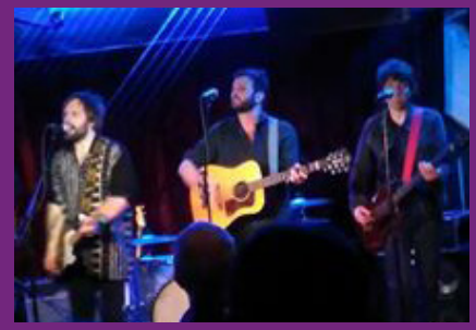
Greens will help protect music venues. Pictured: Orphan Colours performing recently at The Borderline.